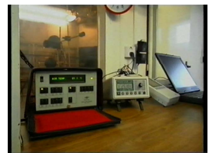
Figure 1 View to the climatic chamber